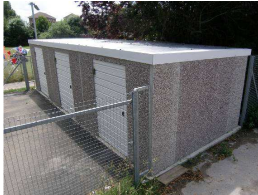
A block of 3 type 'E3' Premium Store Building used for equipment storage by a primary school.