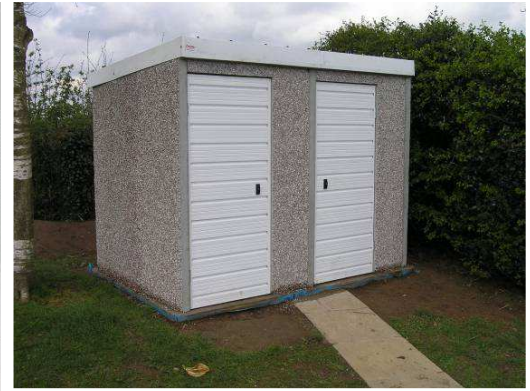
A block of 2 type 'A1' Premium Store Building used for storage of nursery school play equipment.