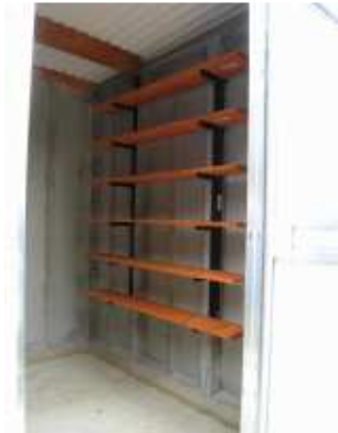
Optional shelving unit